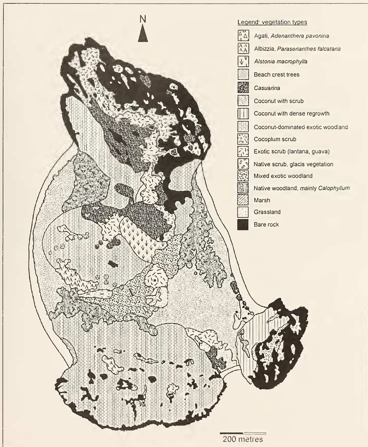
Figure 2. North Island vegetation.